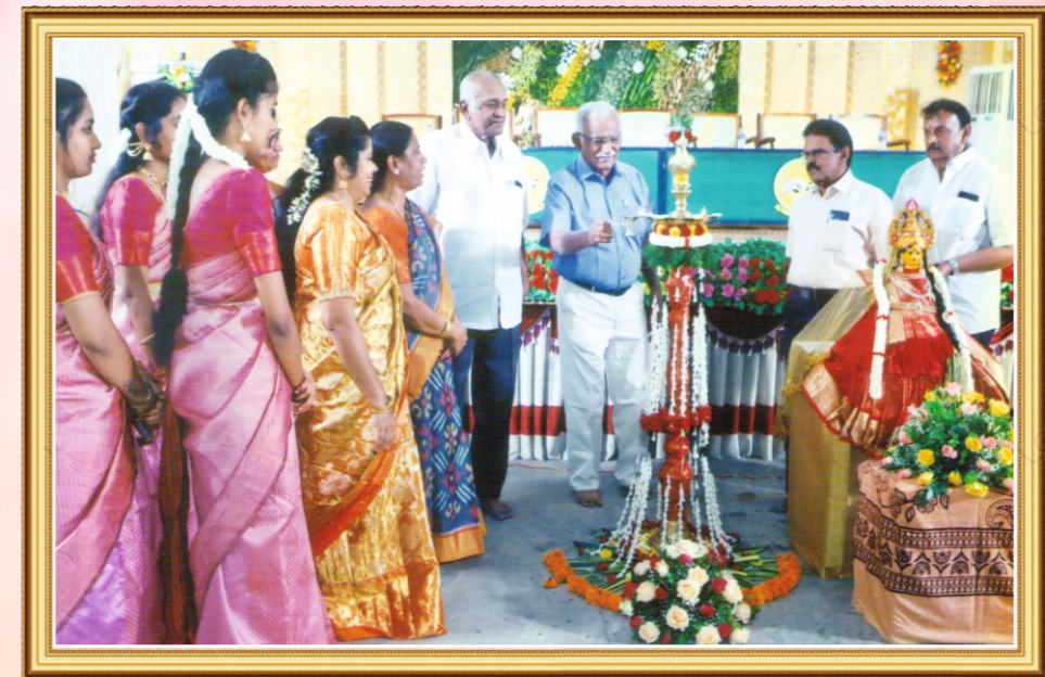
Illuminating Traditions: Kindling the timeless flame of the lamp