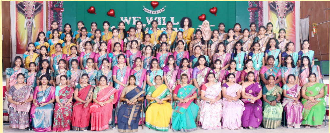
ACCENTURE, VDART, EIT, CAPEGEMINI, BIG TEMPLE SCHOOL