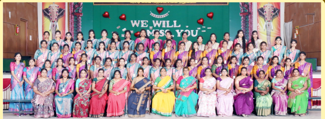
TCS, WIPRO, OMEGA HEALTHCARE, KAMALA NIKETAN SCHOOL, MACE